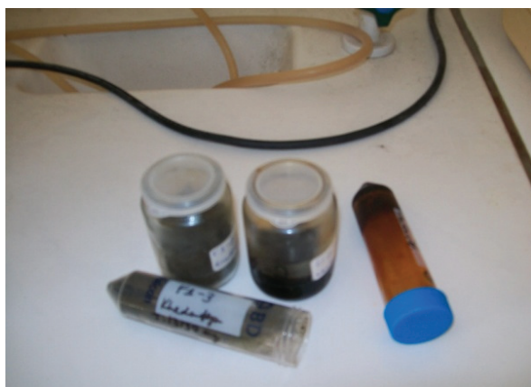
Fig. 1 : MAEG extract obtained after concentration