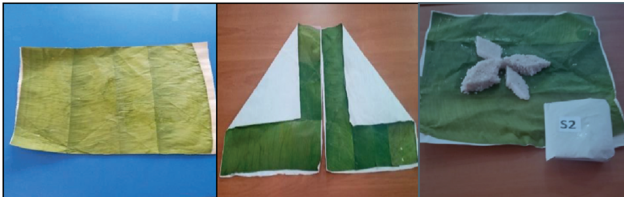
Fig. 2: Prepared food wrappers